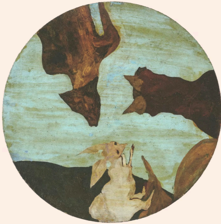
'Untitled (Dog and wolf-like animals)'