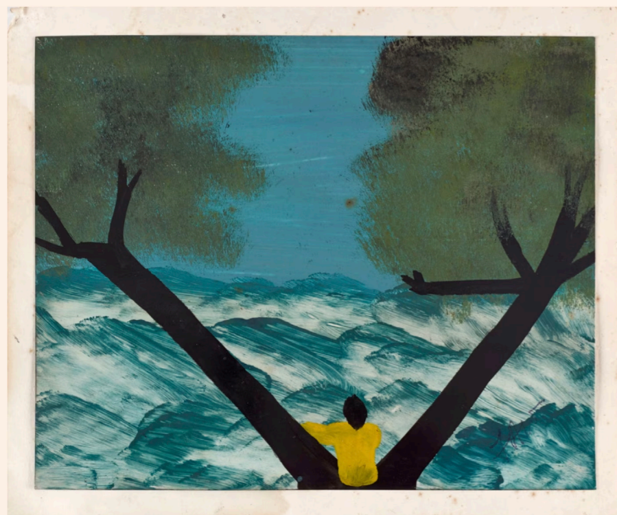
'Self Portrait Series: Yellow Shirt (Man in Tree)'

The Antiguan poet, singer and painter was obsessed with his lineage and the world around him