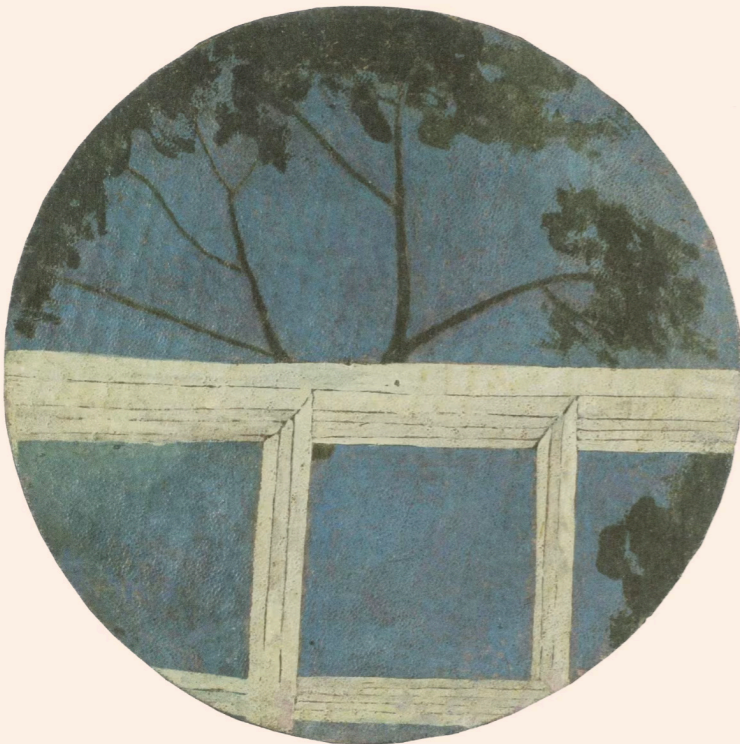
'Untitled (View of trees through open window)'