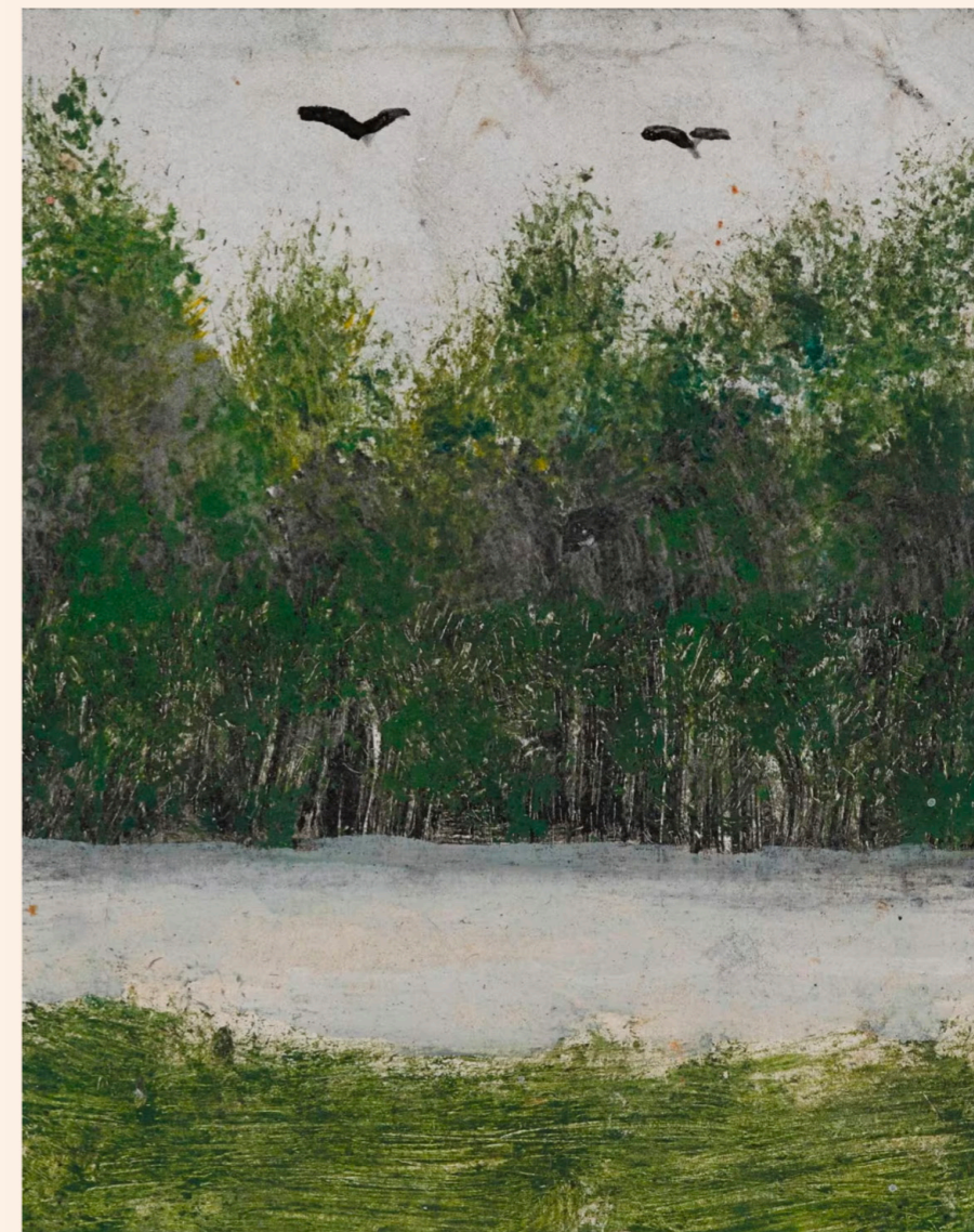
'Untitled (Scotland with white river and trees and two birds in flight)'