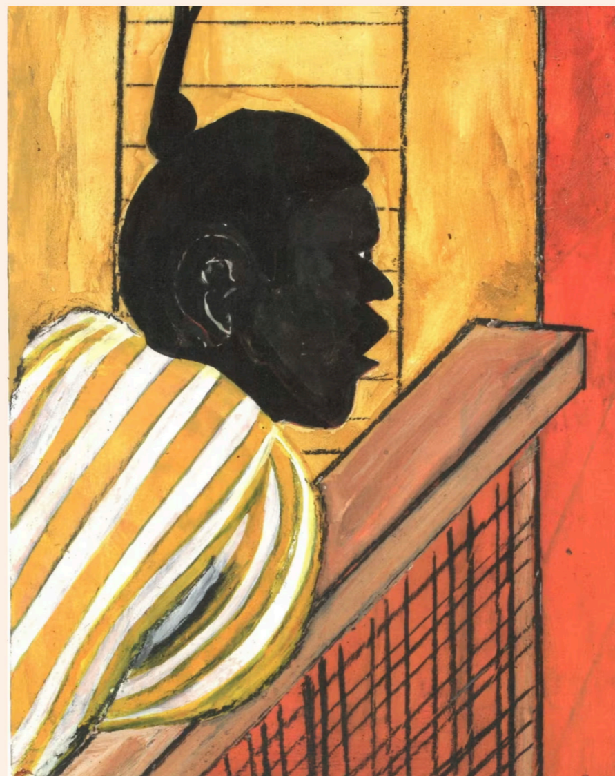
'Profile of a Man in a Striped Shirt'