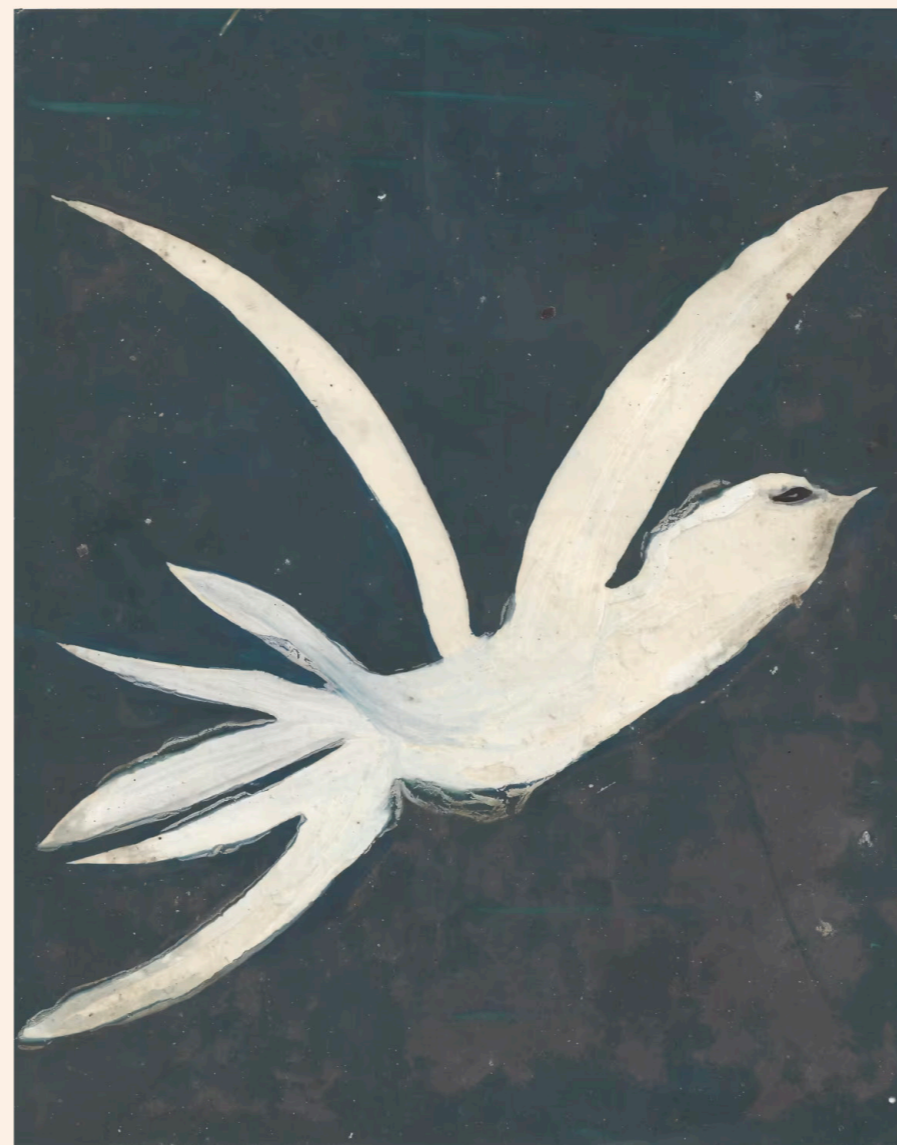
'White Bird' (c1975)

Precision often merges with a kind of hallucinatory ecstasy. The sun rises and sets in lurid glory over meadows and beaches, spreading lavender, mauve, orange and crimson in its wake. Dawn spurts from a mountaintop like lava from an active volcano, spreading beams of divine exaltation. Twilight blurs into bands of luminosity.