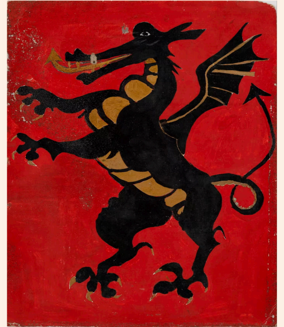
'Untitled (Heraldic Beast [Dragon])'

Walter remained puzzled about his place in the world, but he was an artist of transcendental clarity, harmonising with the 19th-century Romantic spirit of Caspar David Friedrich. Friedrich dropped puny humans into vast landscapes redolent of the divine; his "Monk by the Sea" is a little peg of humanity at the hinge between the Earth and churning sky. Walter painted a mini-version, more geometrical and less overwhelmed by his own insignificance, but equally beatific. A man in a yellow shirt sits in the crook of a V-shaped tree, gazing out at the tropical surf. If the implied thought bubble above Friedrich's monk might be "I am barely here at all," the epigram for Walter's figure would be: "After all that, I'm still here."